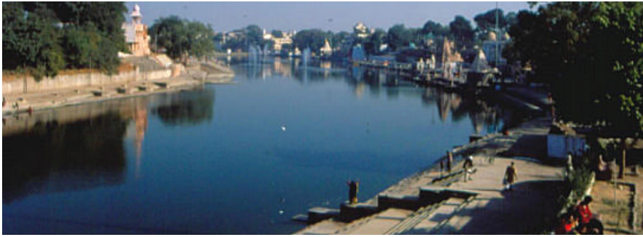
View of Ramghat - Ujjain

What makes our trips so unique and different? Truly, it isn't just one thing. Insider access, unparalleled service and inspired trip planning are just some of the differences that help create the magical trip you are awaiting.