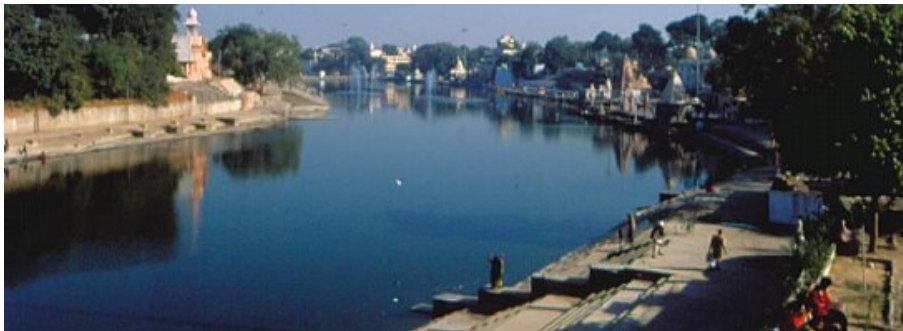
View of Ramghat - Ujjain

Jyotirlinga & Holy Narmada Pilgrimage (4N/5D)