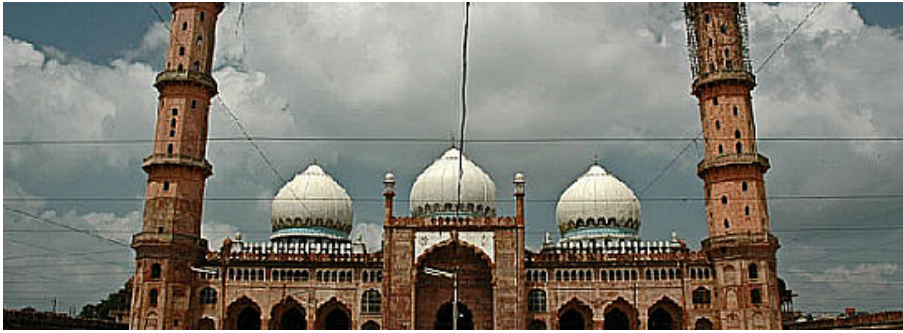
Tazul Masjid Bhopal

What makes our trips so unique and different? Truly, it isn't just one thing. Insider access, unparalleled service and inspired trip planning are just some of the differences that help create the magical trip you are awaiting.