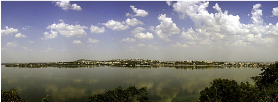
View of Bhopal

What makes our trips so unique and different? Truly, it isn't just one thing. Insider access, unparalleled service and inspired trip planning are just some of the differences that help create the magical trip you are awaiting.