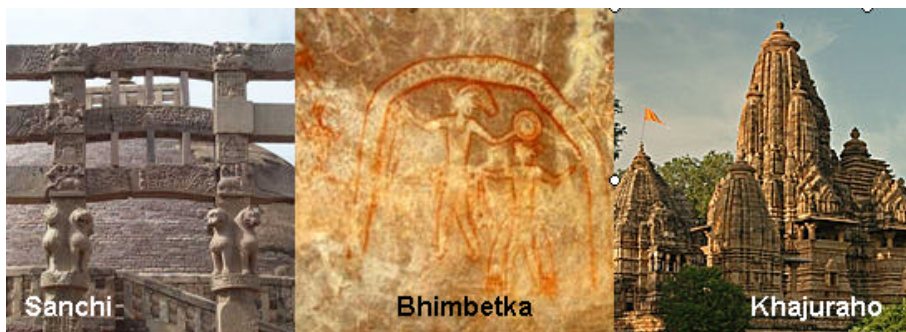
World Heritage Sites in Madhya Pradesh

Sanchi - Bhimbetka - Khajuraho Tour (4N/5D)