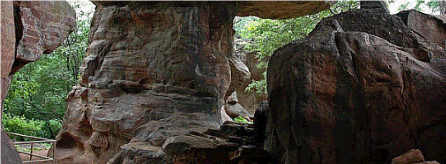
Bhimbetka Rock Shelters

What makes our trips so unique and different? Truly, it isn't just one thing. Insider access, unparalleled service and inspired trip planning are just some of the differences that help create the magical trip you are awaiting.